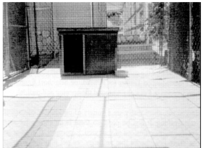
Paver stones help keep this pen clean and attractive

After the panels are laid out and wired down, an old garage door can be laid over a portion of them to provide shelter from rain, and a shaded area. A cautionary note: garage doors are extremely heavy, and you will need help to get them hoisted up. They can be easily